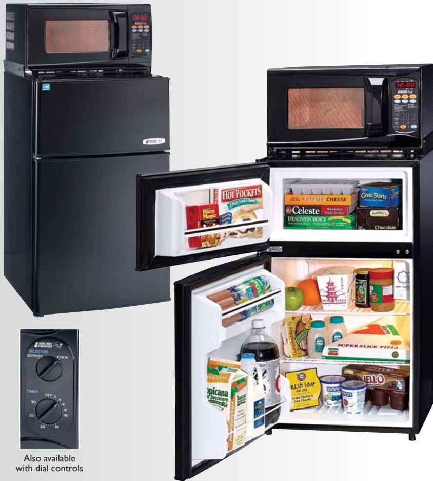
Also available with dial controls

Engineered for value. Designed for life.